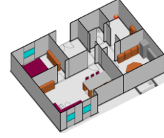
Figure 2. Apartment layout produced using Wireless InSite®.

the rays in our algorithm. However, due to the simplifications made in our algorithm, the simulation time of our algorithm is 29 seconds, which is significantly faster than Wireless InSite®, which took 38 minutes (~75 times higher). It is an absolute advantage for optimizing the placement of the transmitter, which requires enormous time for running multiple simulations with respect to different deployments.